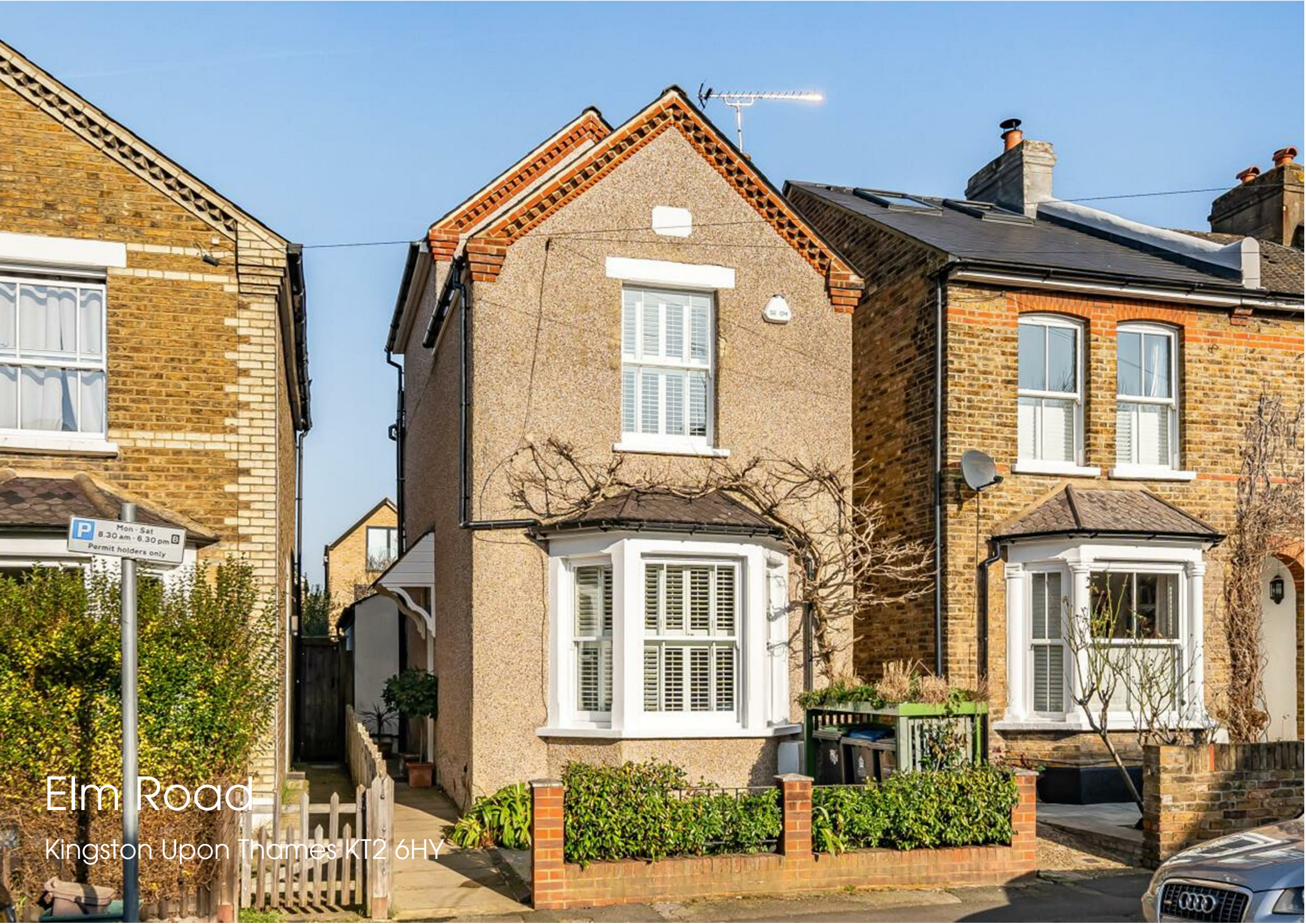
Elm Road Kingston Upon Thames KT2 6HY